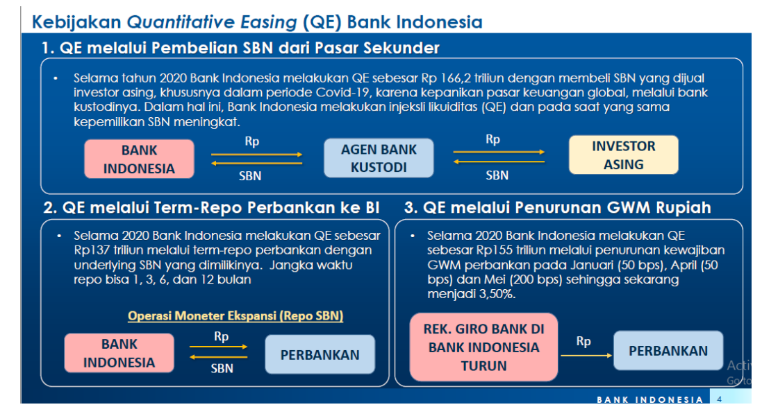
Figure 1: Graphics of QE Implementation by Bank Indonesia

Based on figure 1 above, it can be concluded that the quantitative easing (QE) policy distribution channel is mostly on the echange rate channel, so banks and investment instruments are spillover to be channeled in the form of credit to the community. The impact is an increase in banking assets, a reduction in interest rates, and an insignificant reduction in unemployment, assuming the use of spillover credit for entrepreneurship or business development.